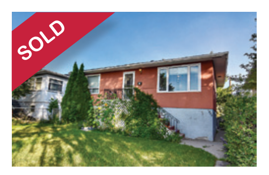
1223 Bantry Street NE List Price: $399,900 Always a privilege working with investors. Congratulations!

1732 7 Avenue NW • C4199079 List Price: $<del>819,900</del> $799,900 Home sweet home perfectly suited for family living.