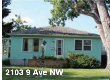
2103 9 Ave NW

MLS #C4149499. Amazing value for this attractive 2 story home in a prime Briar Hill location. Solid construction, timeless style, amazing landscaping with providing 5 bedrooms and a 3 car garage. Listed Price $1,599,900