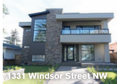
1331 Windsor Street NW

MLS#C4122273. A great location to build your dream home, siding onto the West Hillhurst off-leash park and land reserve. 48 ft wide by 108 ft deep on this R1 street providing front row views in this sought after location. Listed Price $975,000