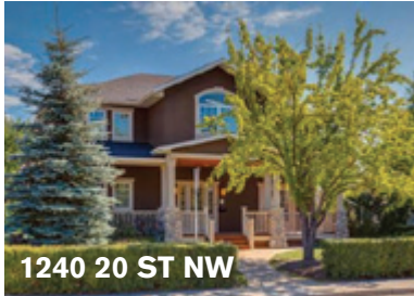
1240 20 ST NW

MLS #C4149499. Amazing value for this attractive 2 story home in a prime Briar Hill location. Solid construction, timeless style, amazing landscaping with providing 5 bedrooms and a 3 car garage. Listed Price $1,599,900