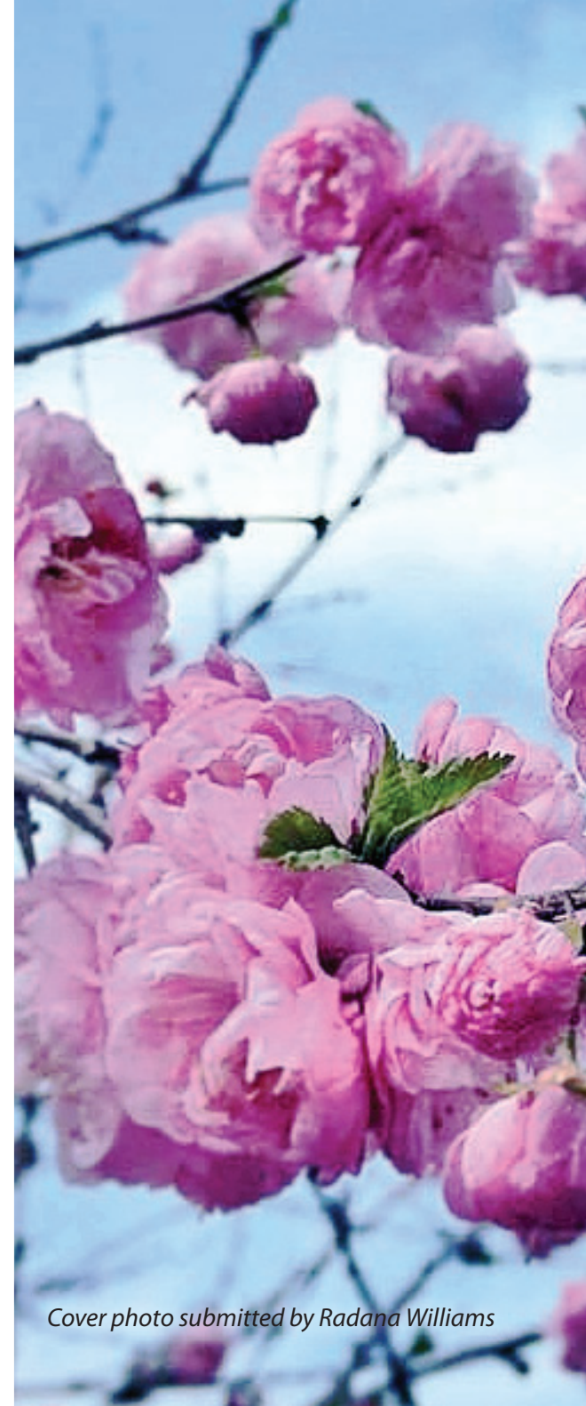
Cover photo submitted by Radana Williams